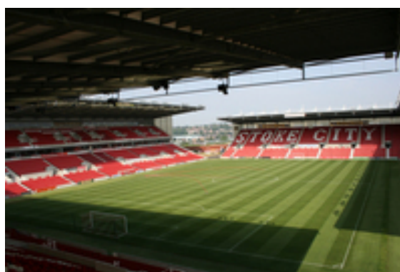
Just four days after the concert, the pitch is all ready for the first pre-season friendly match.

Primo MAXX blocks the production of the naturally occurring plant growth hormone gibberellic acid, which limits cell elongation and leads to more compact growth. As vertical growth is slowed, root and lateral growth are boosted, creating a stronger and denser sward.